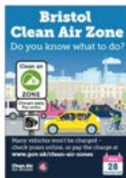
A4 downloadable poster