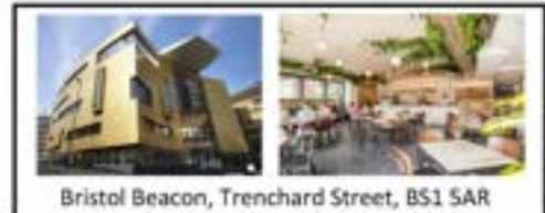
Bristol Beacon, Trenchard Street, BS1 5AR