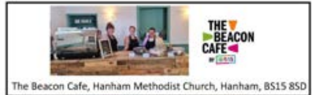
The Beacon Cafe, Hanham Methodist Church, Hanham, BS15 8SD