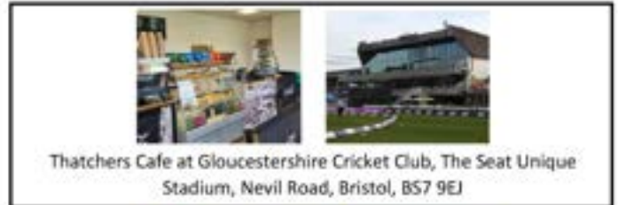
Thatchers Cafe at Gloucestershire Cricket Club, The Seat Unique Stadium, Nevil Road, Bristol, BS7 9EJ