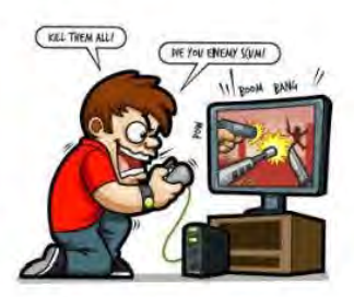
A Parent's Guide to Gaming