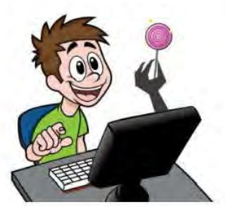
A Parent's Guide to Online Grooming