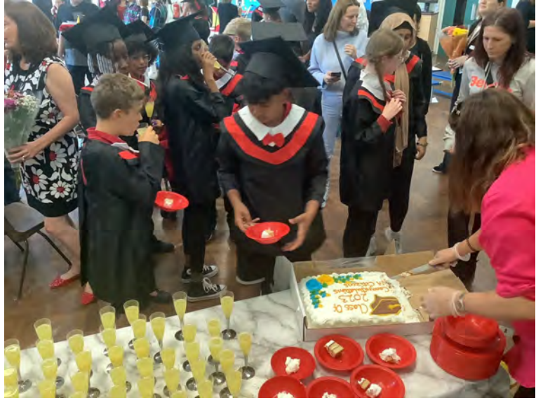
Good Luck Year 6