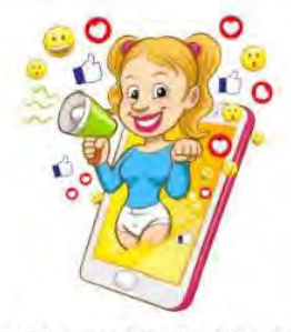
A Parent's Guide to Online Influencers