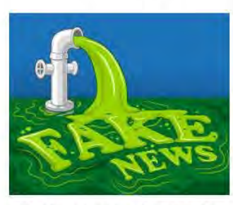
A Parent's Guide to Fake News