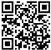
Online safety and safeguarding