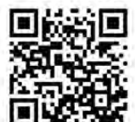
Reading at Home