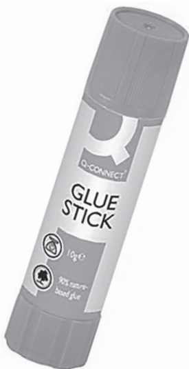
a glue stick, yesterday

Table 1=1 Table 2=1 Table 3=1 Table 4=0 Table 5=2 Table 6=0