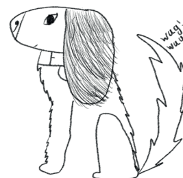
artist's impression of what the new dog might look like