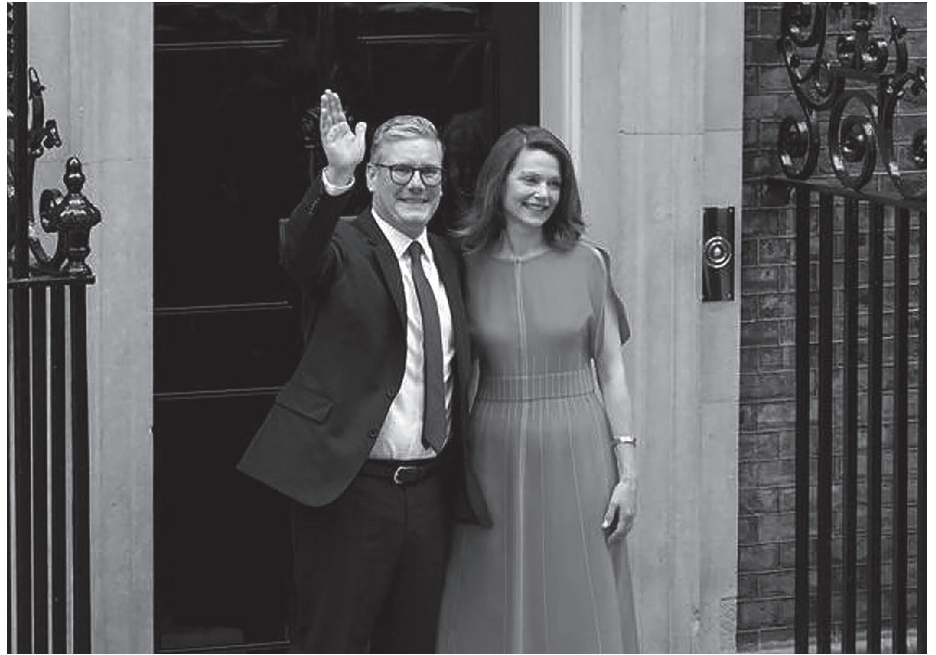
Kier Starmer, outside No. 10 Downing Street.